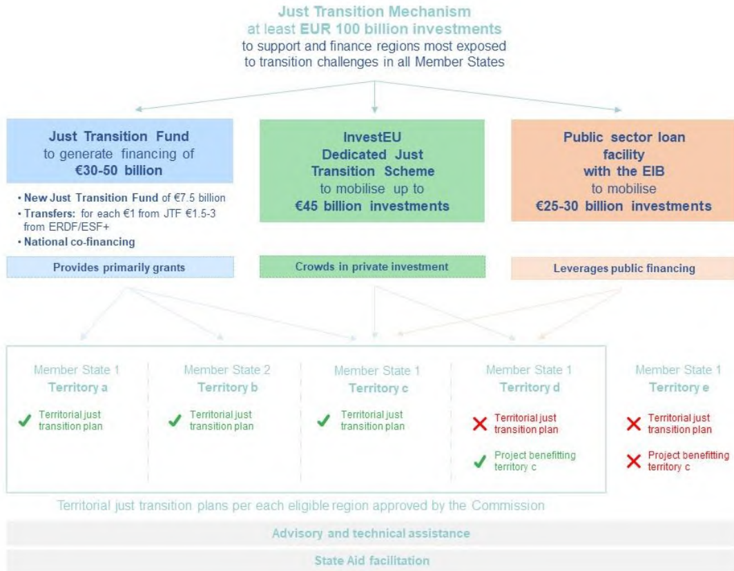
Figure 4. Financing the Just Transition Mechanism

Each pillar will assist with different grant and financing instruments in order to offer a full range of support options in line with the needs to mobilise investments benefiting the most impacted regions. To ensure coherence between the three pillars, the Just Transition Fund will be used to provide primarily grants; the dedicated transition scheme under InvestEU will crowd in private investments, and the new just transition public sector loan facility will leverage public financing. These measures will be accompanied by dedicated advisory and technical assistance for the regions and projects concerned. The Just Transition Mechanism will include a strong governance framework centred on territorial just transition plans.