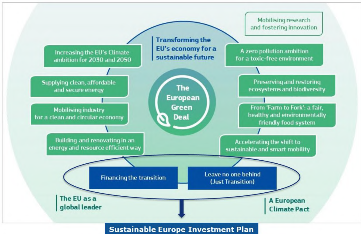
Figure 1. The Investment Plan within the European Green Deal

The Sustainable Europe Investment Plan will enable the transition to a climate-neutral, green economy across the following three dimensions: