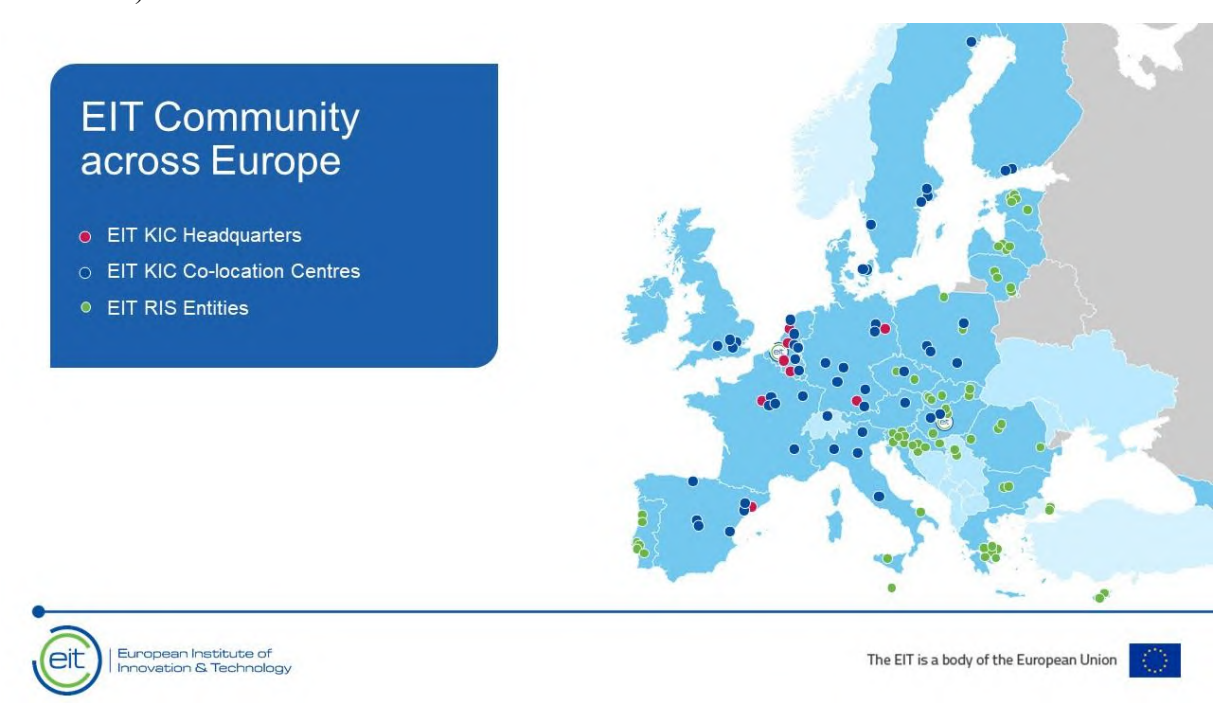
Figure 3: EIT in Europe, source: EIT, 2018

in knowledge triangle activities as part of the a KIC community. This is also reflected in the share of EIT funding allocated to EU-13 partners (8.3% as compared to 4.8% in Horizon 2020 as of 2018).