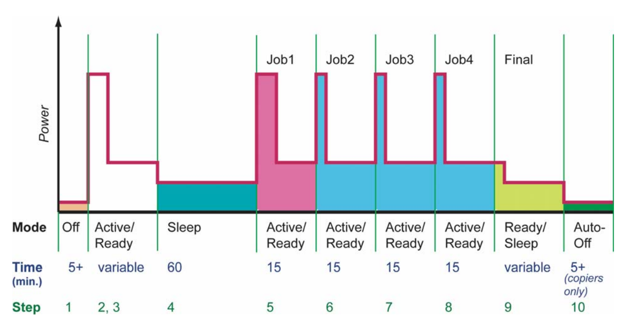
FIGURE 2 - TEC Measurement Procedure

Figure 2 shows a graphic form of the measurement procedure. Note that products with short default-delay times may include periods of Sleep within the four job measurements, or Autooff within the Sleep measurement in Step 4. Also, print-capable products with just one Sleep mode will not have a Sleep mode in the final period. Step 10 only applies to copiers, digital duplicators, and MFDs without print-capability.